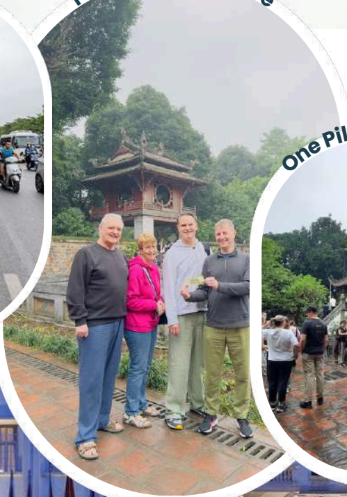
One Pillar Pagoda