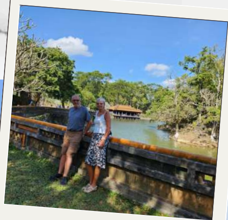
Tu Duc Tomb